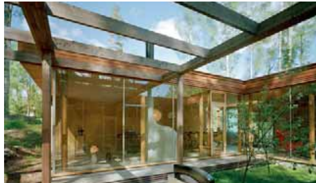
By courtesy of architect Olavi Koponen Jussi Tiainen